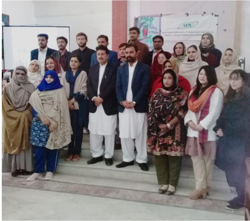
Then Minister of Education at the concluding session of Kitab Dost pilot phase, with DEO-F, Director DAC, Executive Committee members of ABPAW and Kitab Dost volunteers

In 2020 Kitab Dost was rolled out in 45 primary schools (20 boys' and 20 girls' public schools and five low-cost private schools). During this year more than 3000 primary school age students were targeted.