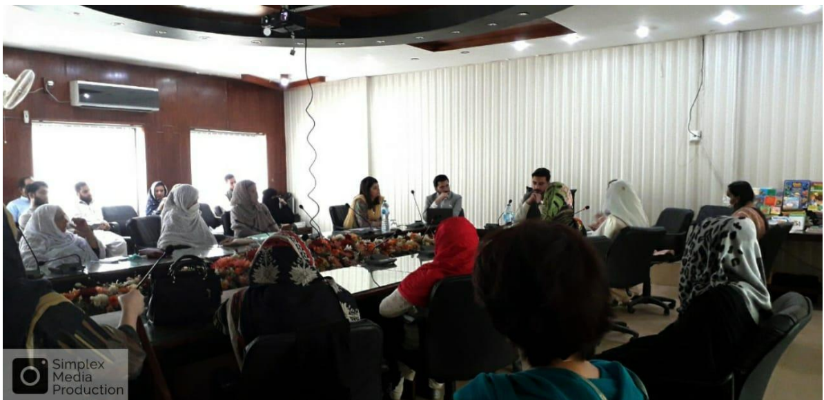
Inauguration of the second phase – Director Peshawar Model Educational Institutes, CEO Khwendo Kor, CEO Parwan e Khanam with volunteers

In 2020 Kitab Dost was rolled out in 45 primary schools (20 boys' and 20 girls' public schools and five low-cost private schools). During this year more than 3000 primary school age students were targeted.